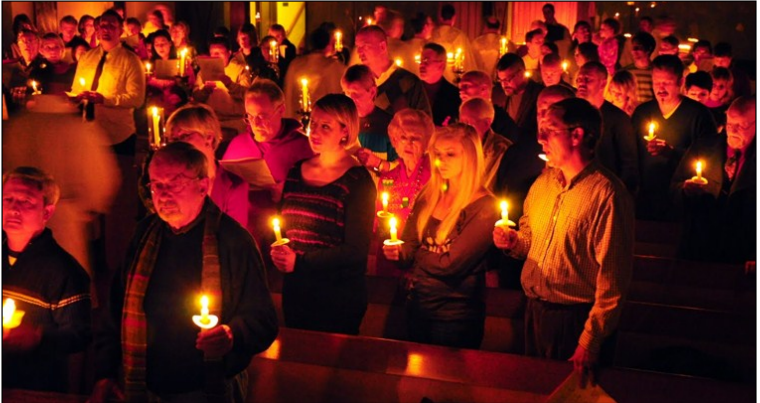
The congregation sings "Silent Night" during St. Matthew's Christmas Eve candlelight service.